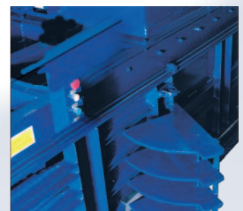
Elephant Ear Dawg Assembly Used On Horizontal Foam Balers is a Max-Pak Innovation That Provides Maximum Holding Capacity for Baling Foam.

Other companies modify cardboard and plastic balers to accommodate foam, but we've learned that foam is a different beast altogether. What works on cardboard or plastic just won't handle foam – from feed openings, to hydraulic systems, to material retention and bale escapement. So we took a different approach, and designed a baler specifically made to tame the beast.