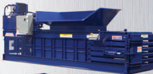
Horizontal Closed End Balers