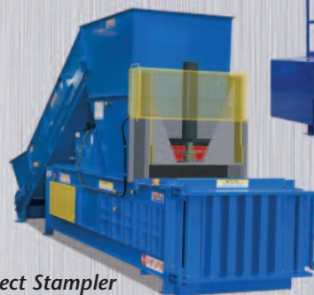
Full Eject Stampler