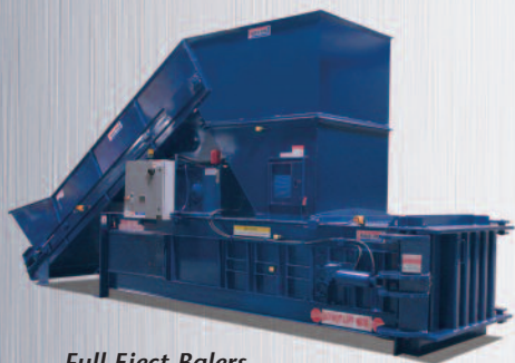
Full Eject Balers

Call Us For More Information, or to Locate Your Nearest Dealer.