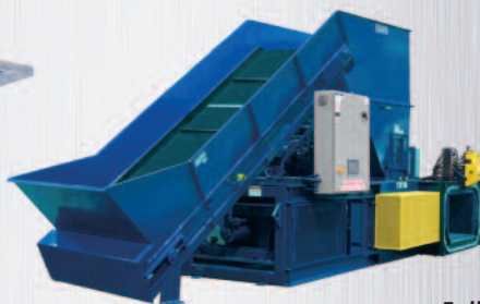
Answer Two-Ram Baler